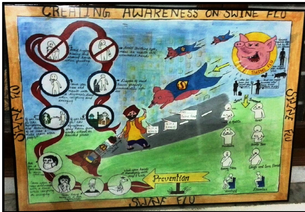
Creating awareness on swine flu