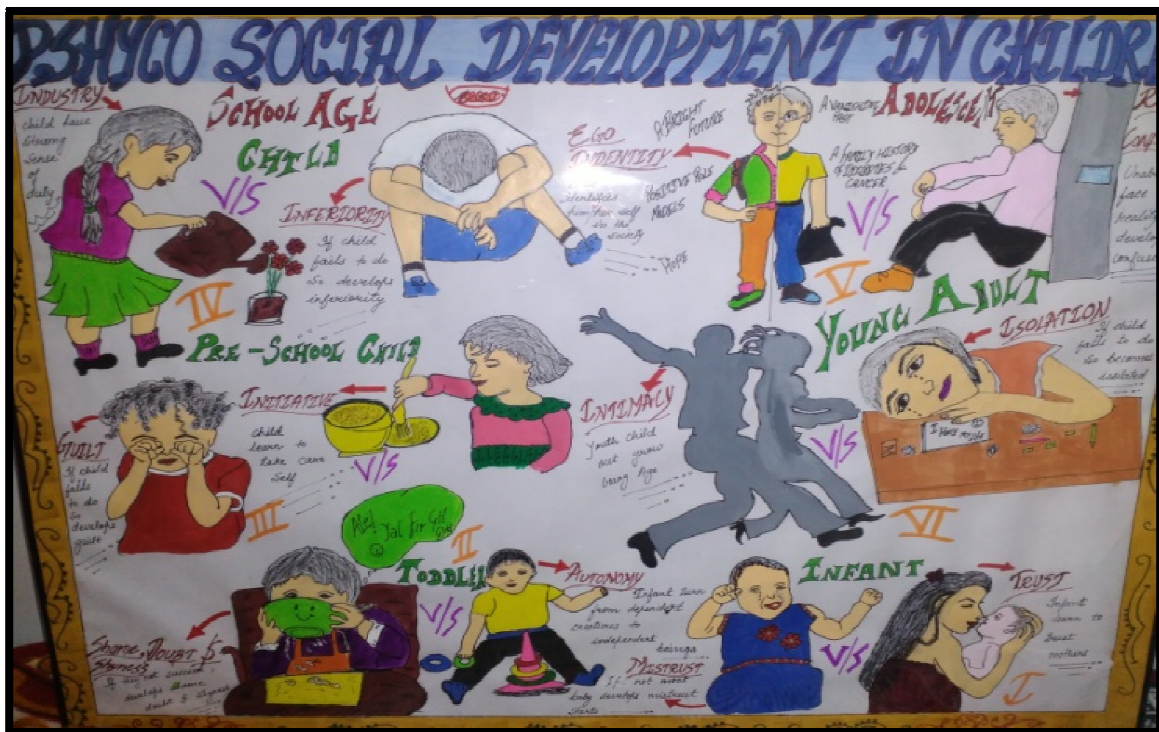
Psycho-Social Development in Children